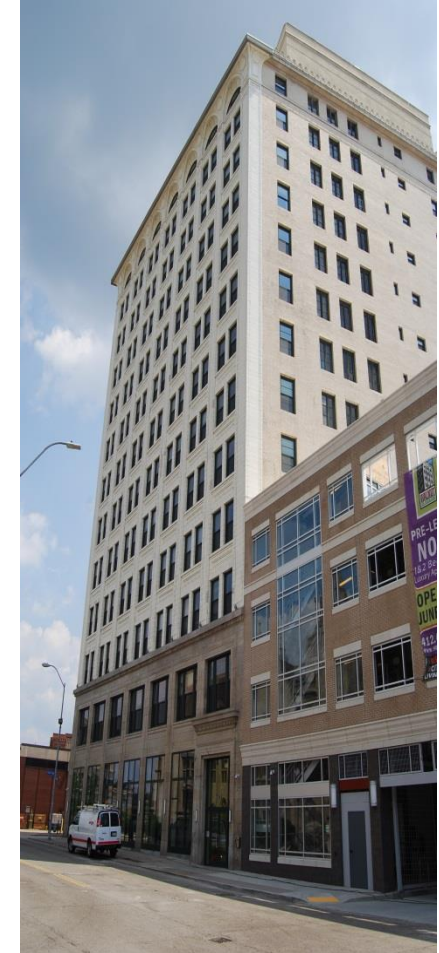
Highland Building Exterior