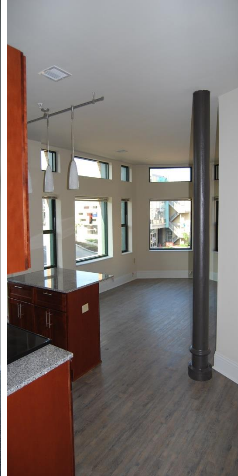
Apartment Living Room